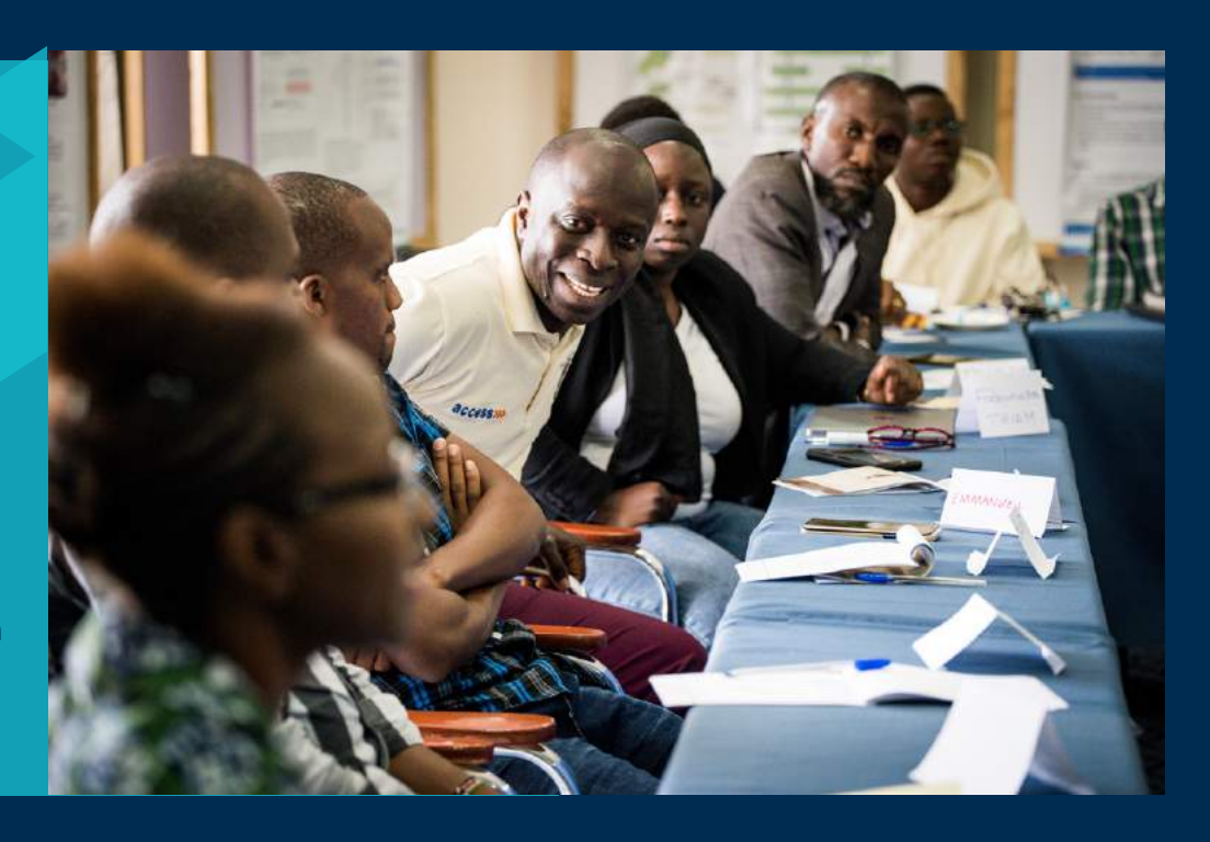
Photo: RSIF PhD student training on the sidelines of the 5th PASET Forum in Kigali, Rwanda, May 2019.

In 2019, <u>University of Ghana (UG)</u> was competitively selected as an RSIF African Host University in the PASET priority thematic area of Food Security and Agribusiness. The selected PhD programme at UG is in Applied Agricultural Economics and Policy/ Agribusiness.